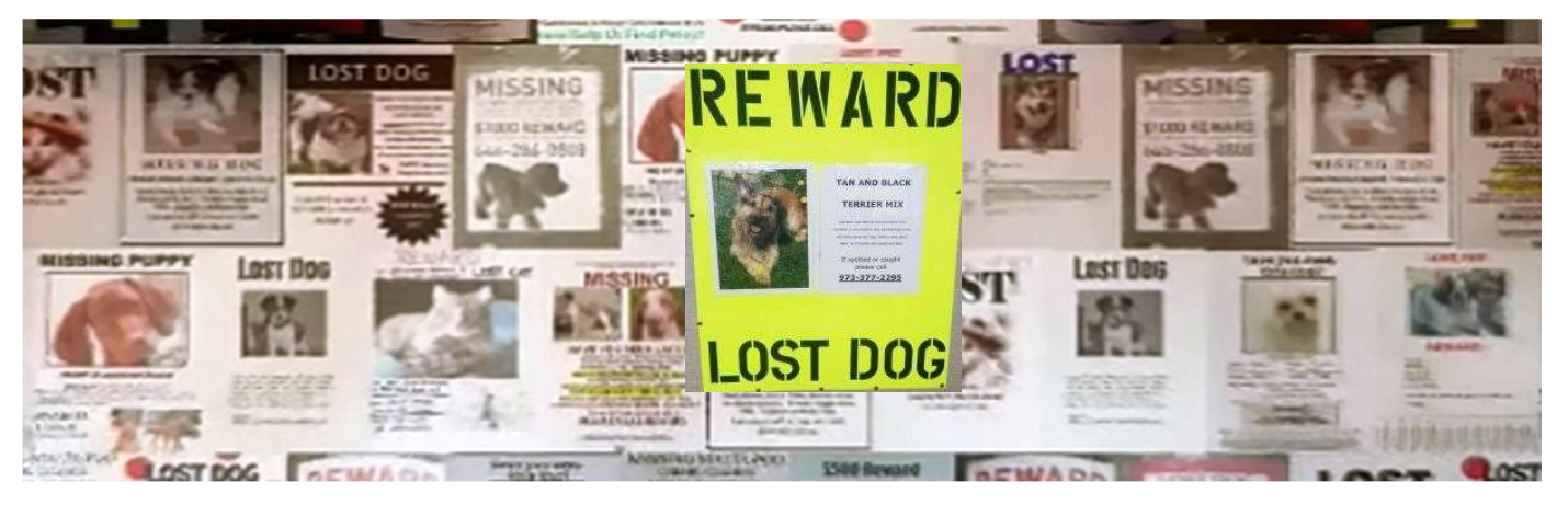
Please inquire within for lost pet assistance and free posters to aide in your search!

All too often flyers go unseen because they blend in! Ensure everyone sees your posters by following this model.